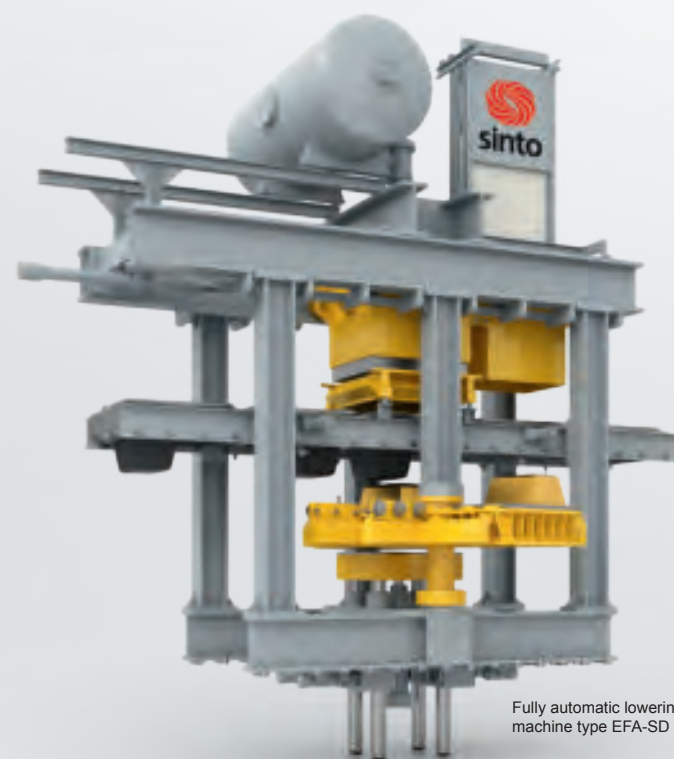
Fully automatic lowering moulding machine type EFA-SD