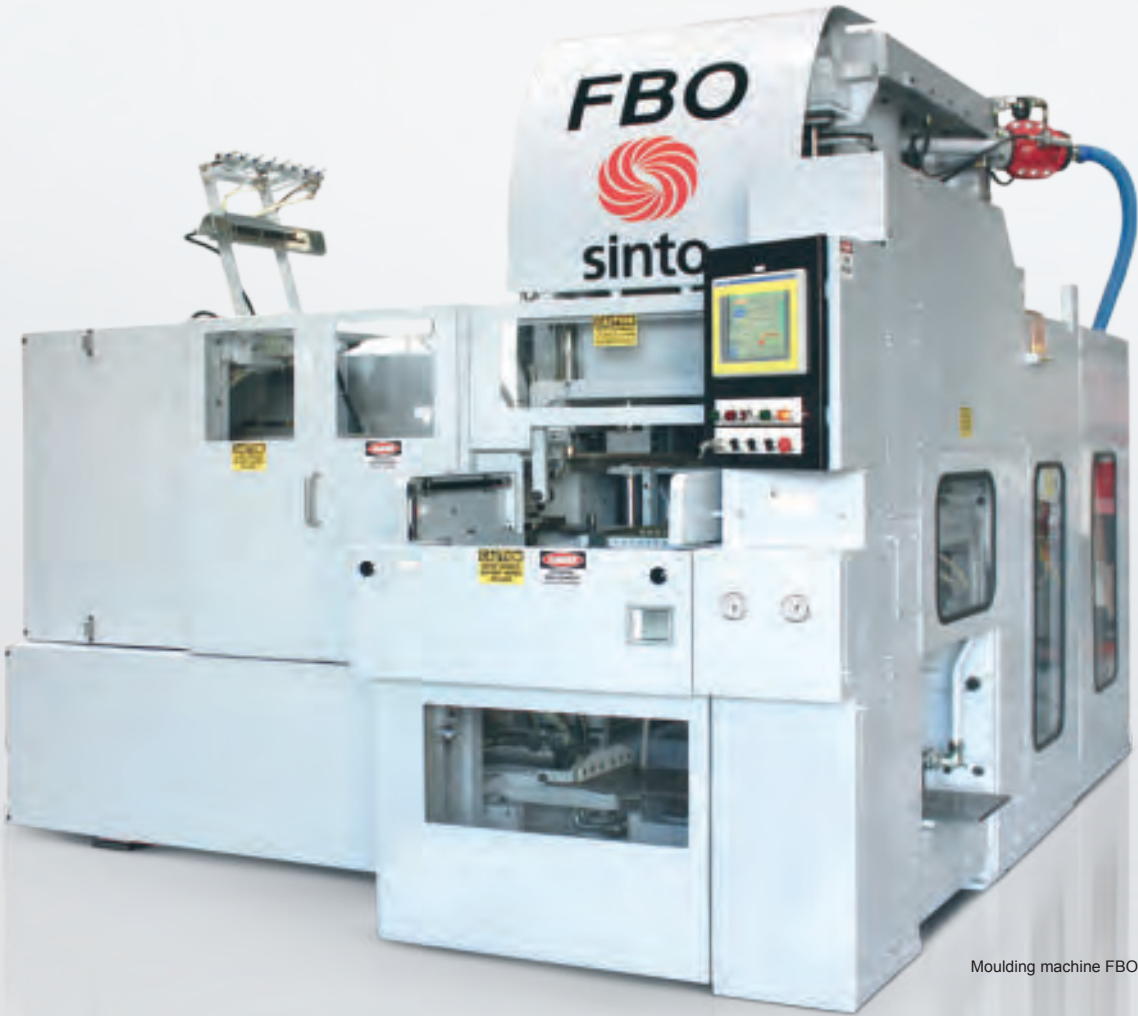
Moulding machine FBO

including a two-stage, uniform compaction using opposing squeeze plates. The highest precision – without flasks – is possible thanks to the horizontal mould partition.