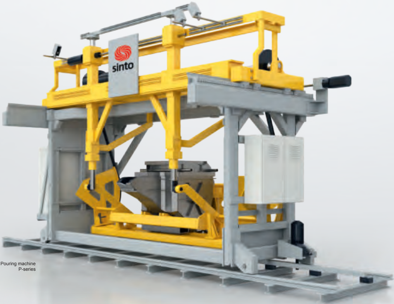
Pouring machine P-series