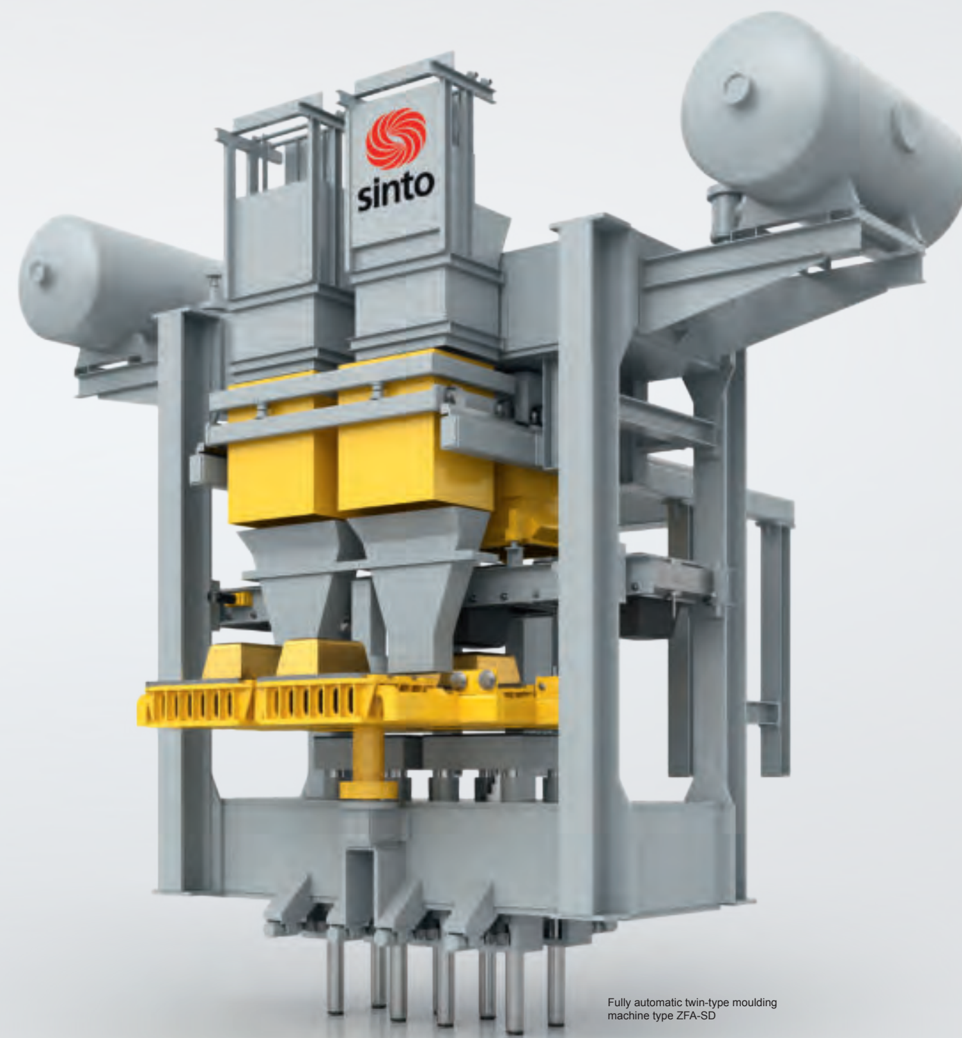
Fully automatic twin-type moulding machine type ZFA-SD