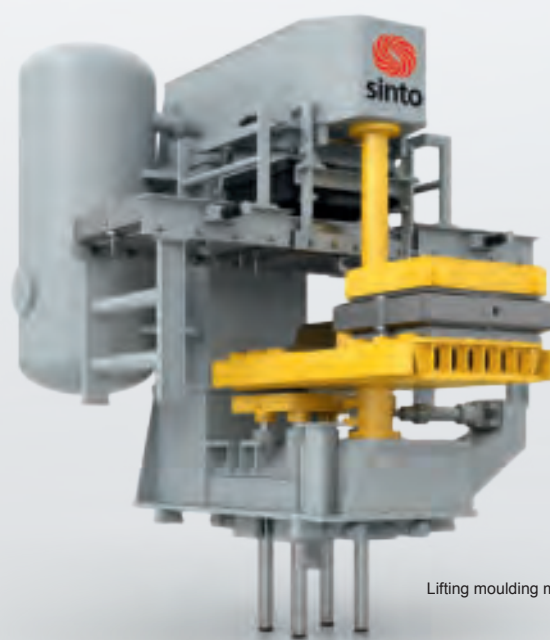
Lifting moulding machine HSP