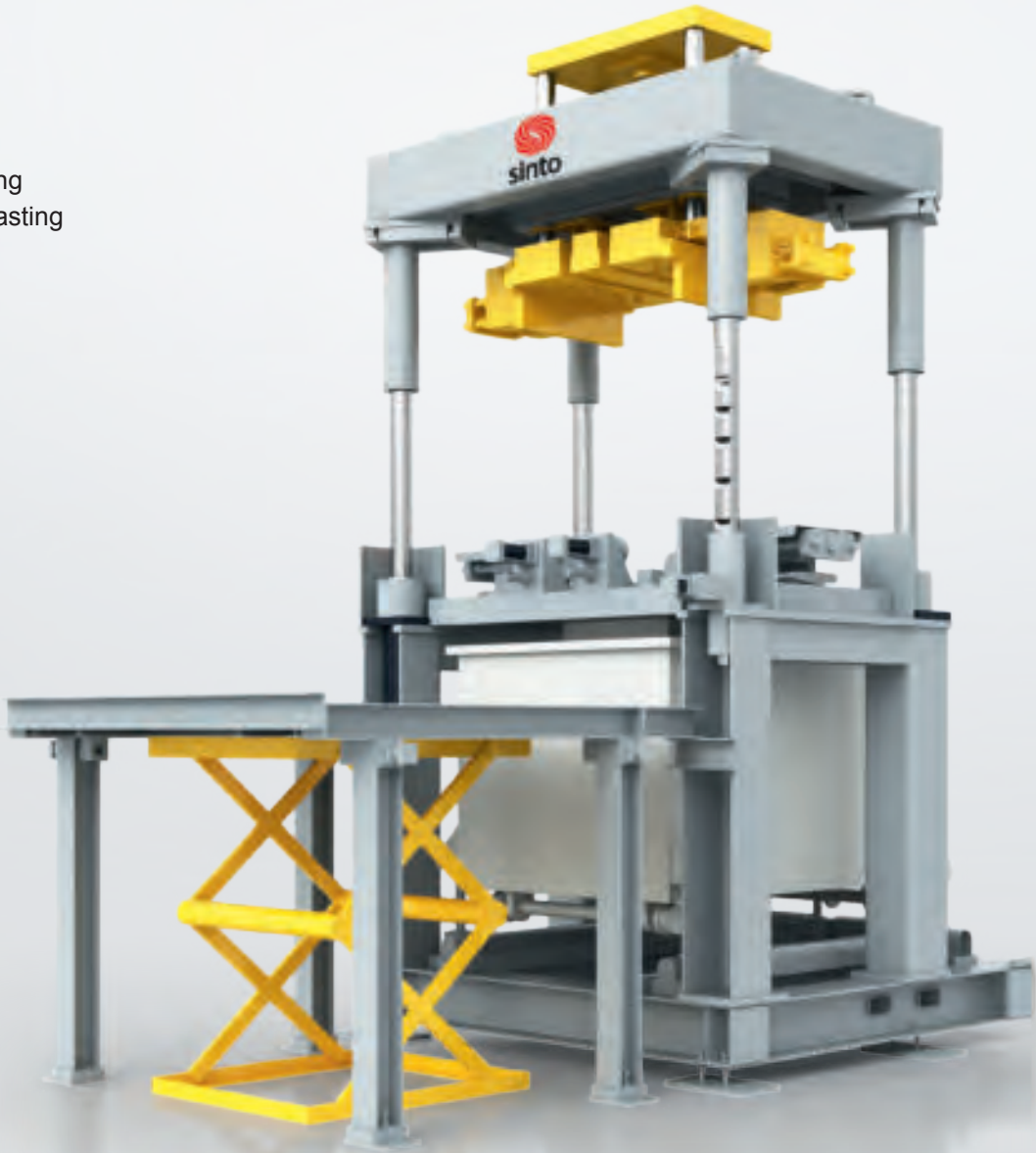
Low pressure casting machine LPD-II